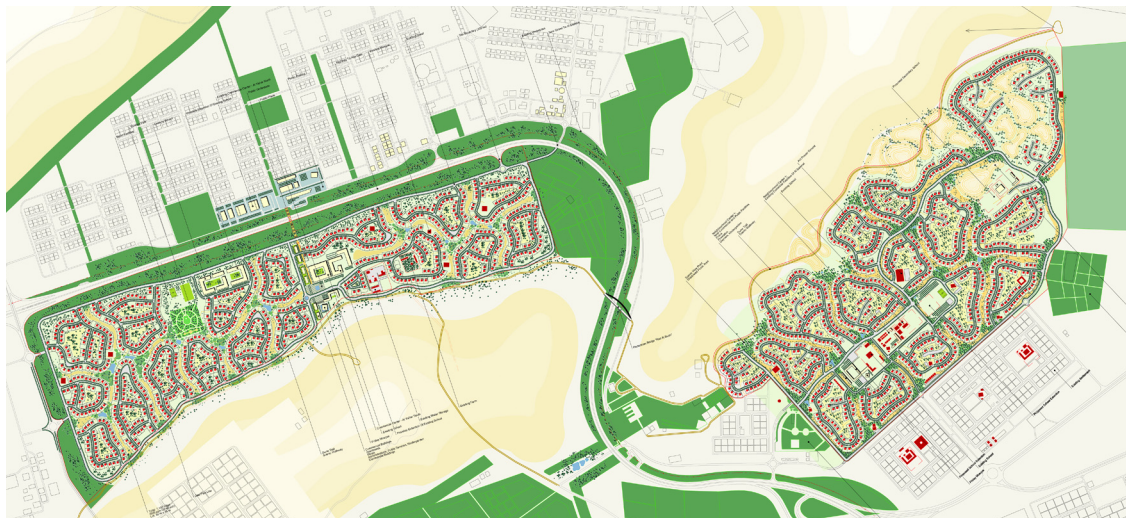
urban design layout

client: Dorsch Consult Abu Dhabi for Emirate of Abu Dhabi – The Committee of Residential Development project area: 700 ha planning: 2006